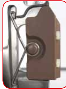
Interchangeable metal scrapers