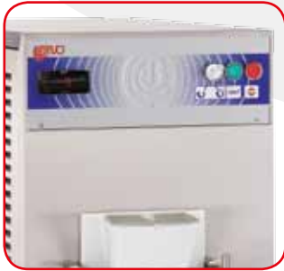
Thermo-regulator by display