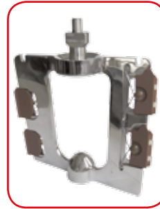
Two blade mixer