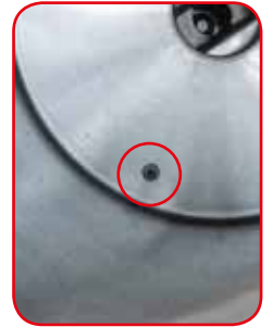
Probe in direct contact with the mix