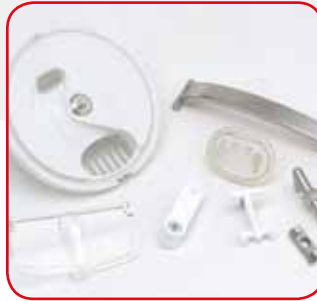
Complementary door is disassembled without the use of tools, for a perfect hygiene